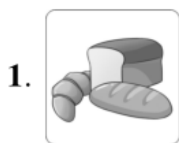
table elephant bread umbrella flower