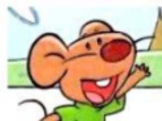
第 2 题