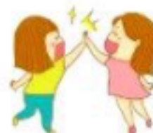
第 4 题