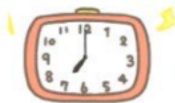
第 1 题