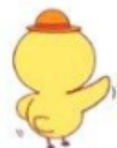
第 5 题