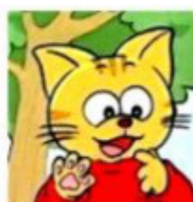
第 3 题